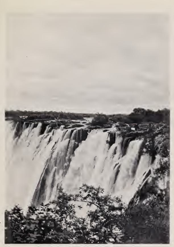
THE EASTERN CATARACT, VICTORIA FALLS