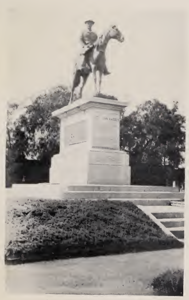
STATUE OF RHODES AT KIMBERLEY