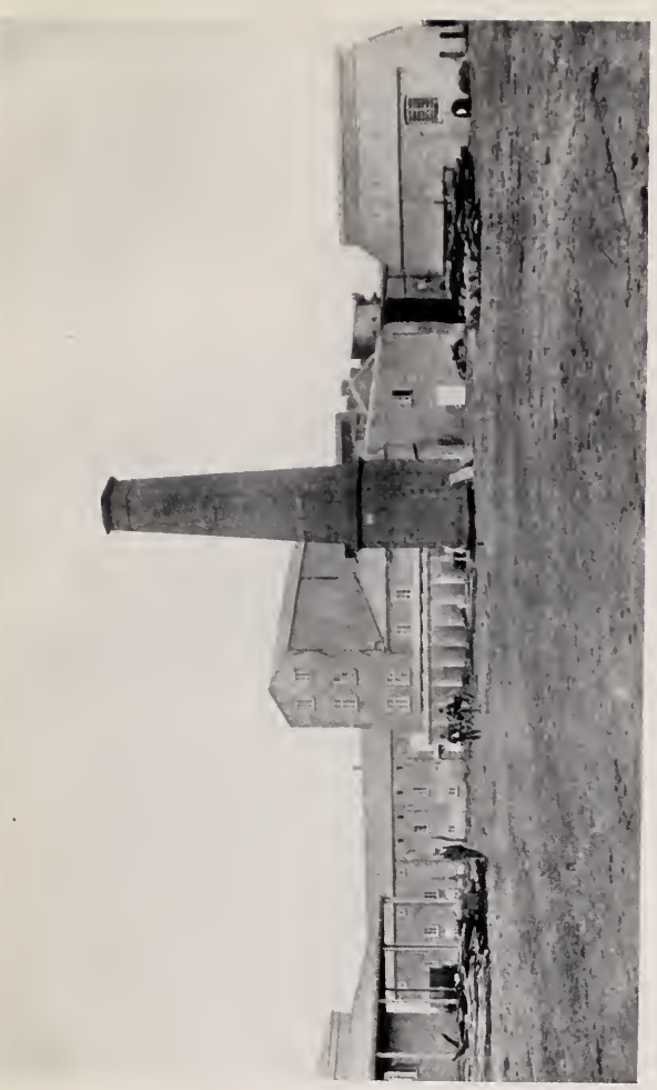
THE DISTILLERY AT PRETORIA, 1885