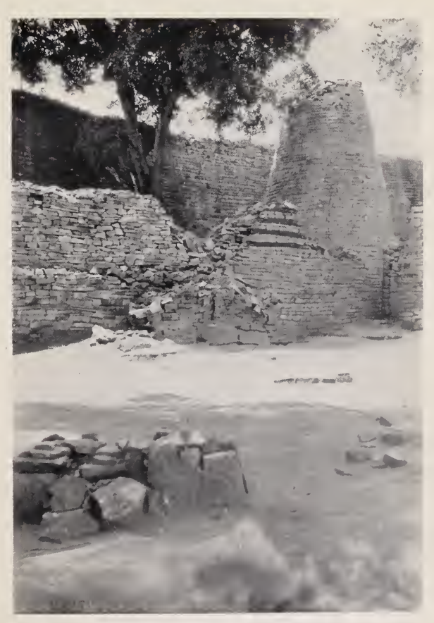
Ruins of the Temple at Zimbabwe