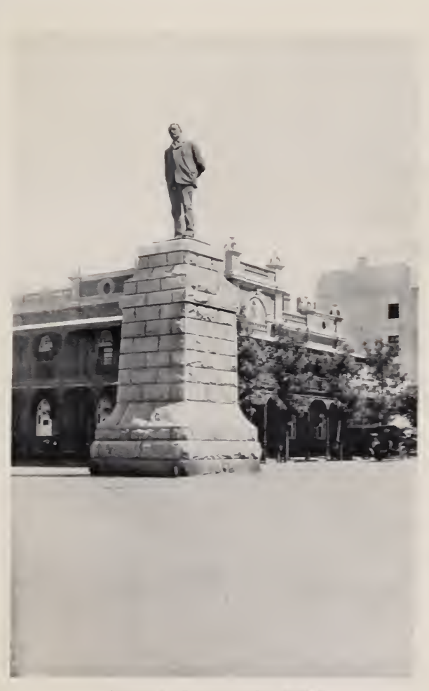
STATUE OF RHODES AT BULANA