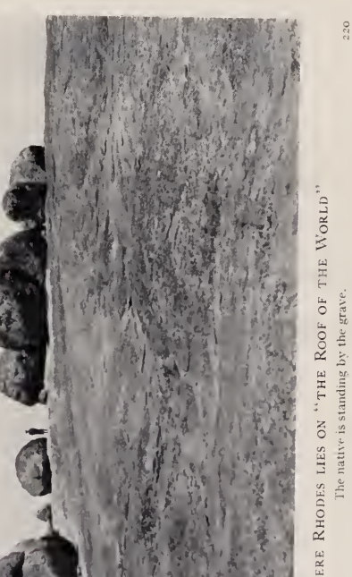
WHERE RHODES LIES ON "THE ROOF OF THE WORLD" The native is standing by the grave.