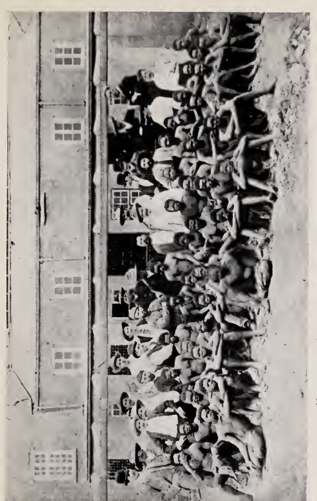
NATIVES AND OVERSEERS AT THE DISTILLERY AT PRETORIA, 1885